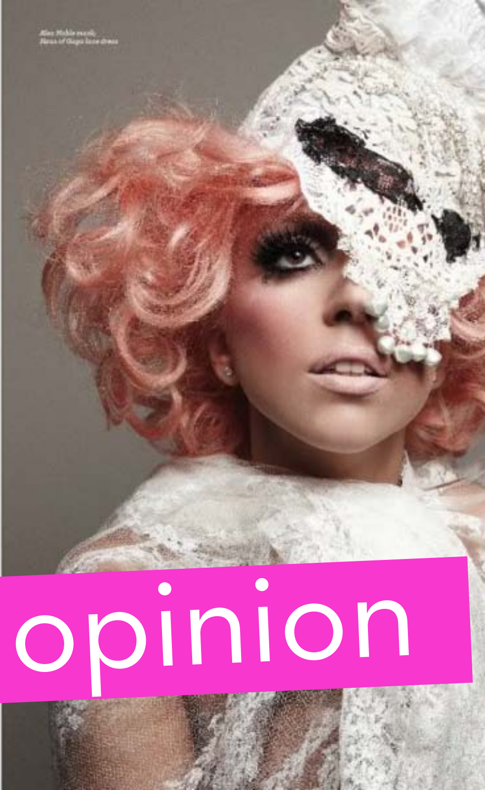
Also: Noble march. Stars of Gaga love dress